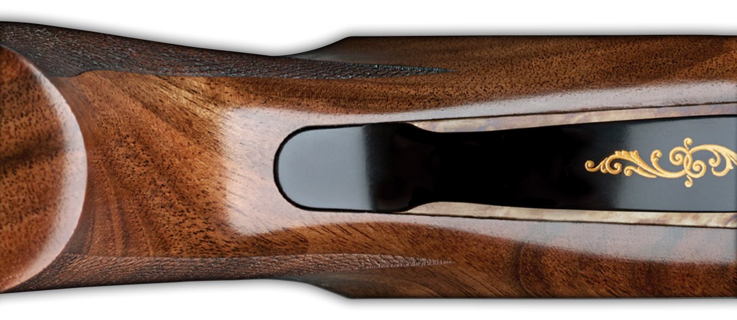
On the bottom of the receiver and trigger guard, the decorative gold design is classy and sophisticated.

and on the bottom of the trigger guard, the decorative gold design is classy and sophisticated. Also, on the bottom of the receiver is the model Invictus II engraved in gold. Funeral engraving is a derivative of the 'funeral grade' of shotguns which is a colloquial term to describe a break-open gun of any quality but often of the very highest, bearing the least-possible decoration; with either no engraving at all or only a simple borderline.