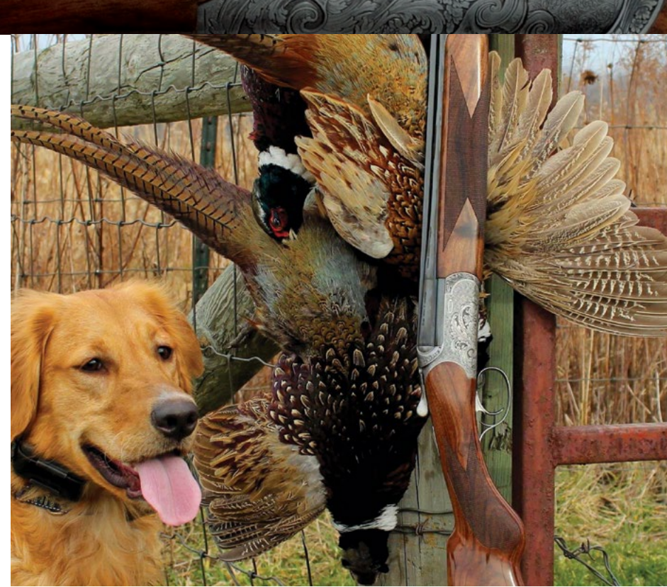
Young Jak put my gun-handling skills to the test during a spirited chase after two of these roosters. The third bird tried to turn me into a pretzel, as it flew right at and just over my head. If there are any design flaws in the Guerini Ellipse Evo, they didn't show up in our field test.

The ability to withstand shotgun recoil varies widely among wingshooters, so I enter into a discussion of the topic with some misgivings. But it is worth noting, the Caesar Guerini line of 20-gauge field guns are of a compromise weight which makes the guns easier to carry afield than most 12-gauge guns, while possessing sufficient heft to dampen the recoil of loads designed to harvest larger birds at an acceptable range. Various formulas pro-